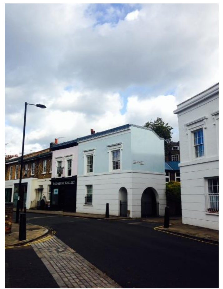
Image 3: View looking north along Thornhill Road from Ripplevale Grove